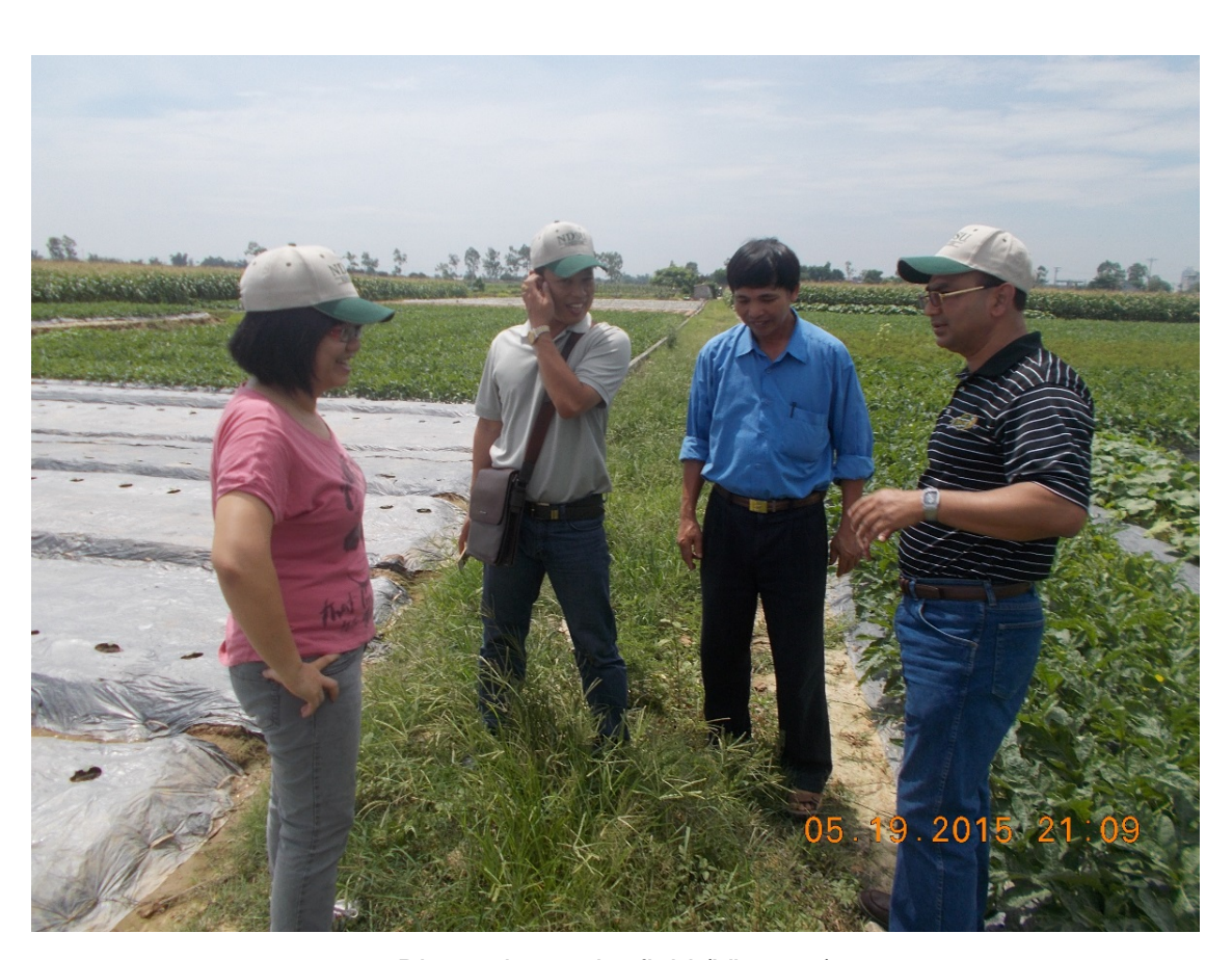
Discussion at the field (Vietnam)