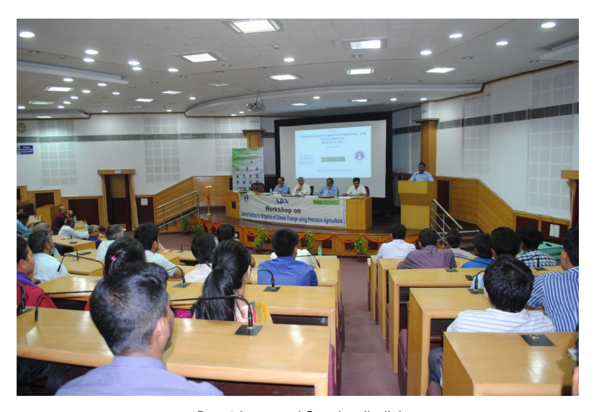
Day 1 Inaugural Session (India)