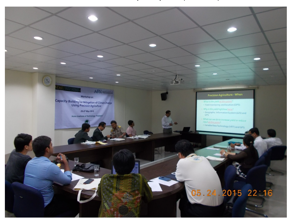
Presentation by the project coordinator (Thailand)