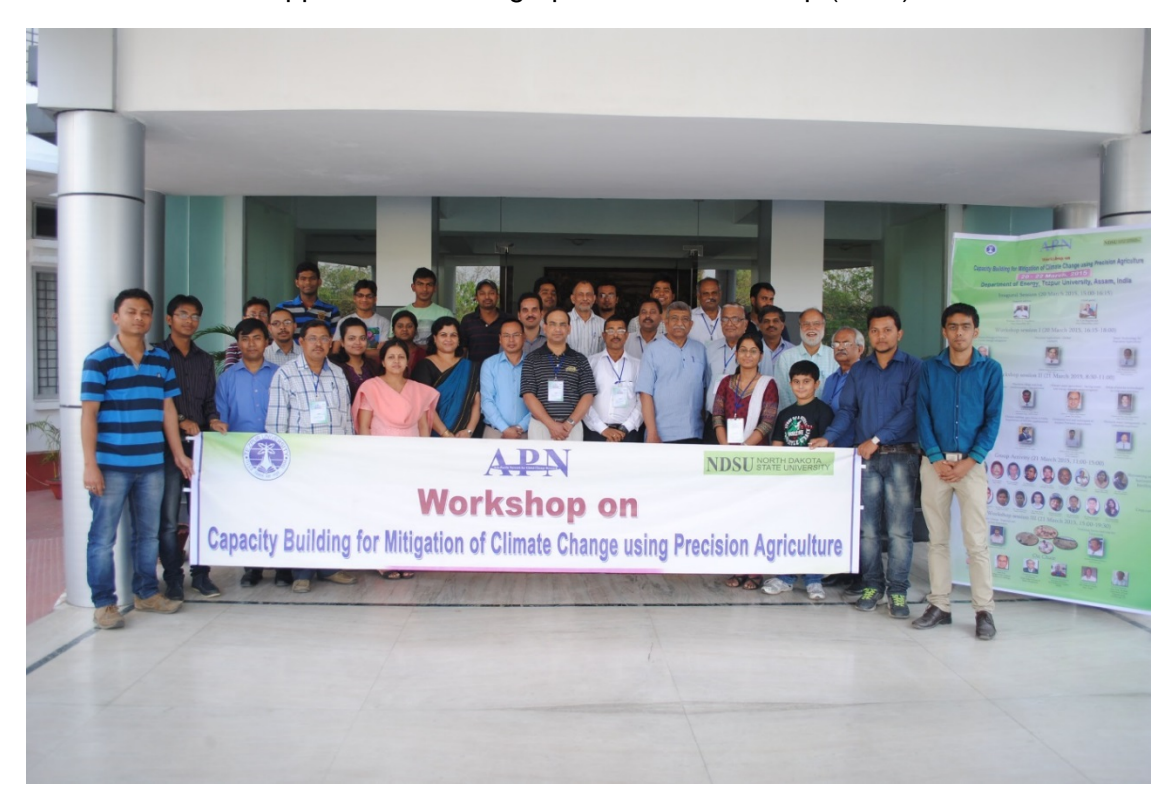
Group Photo participants (India)