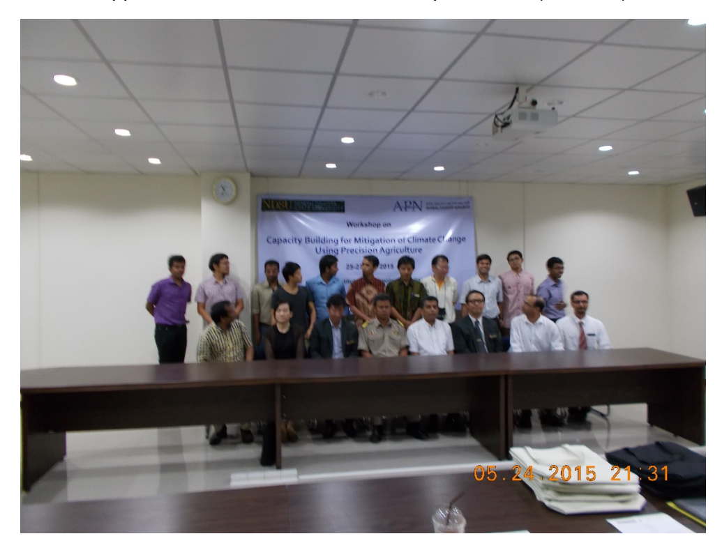
Group photo of the participants in Thailand