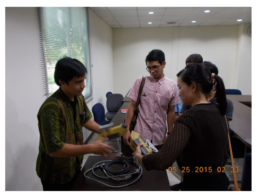
Demonstration of crop sensors used to optimise agricultural input resources (Thailand)