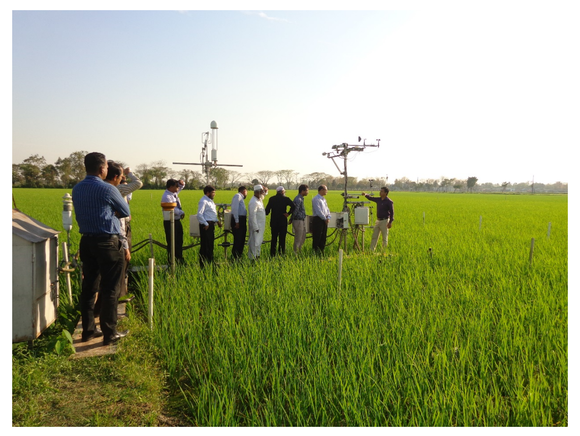
Field lab visits (Bangladesh)