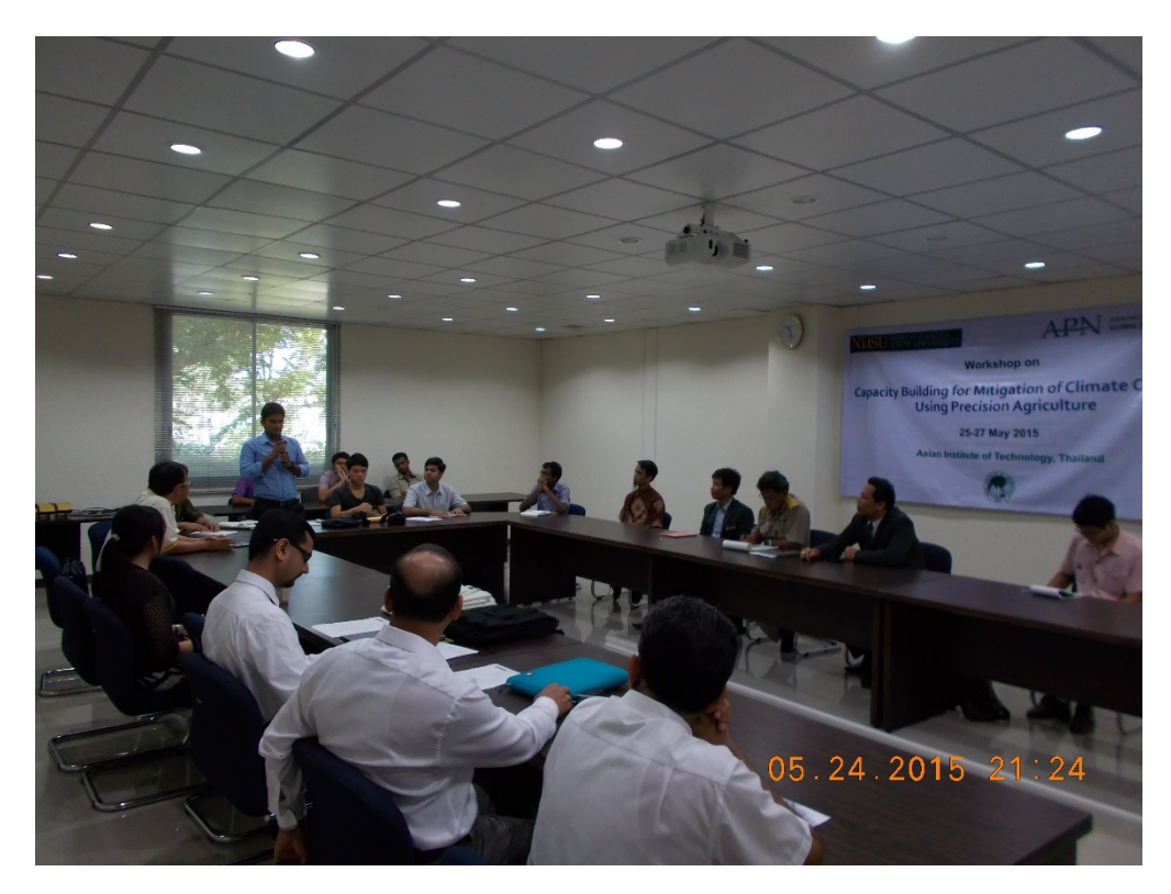
Queries from the participants (Thailand)