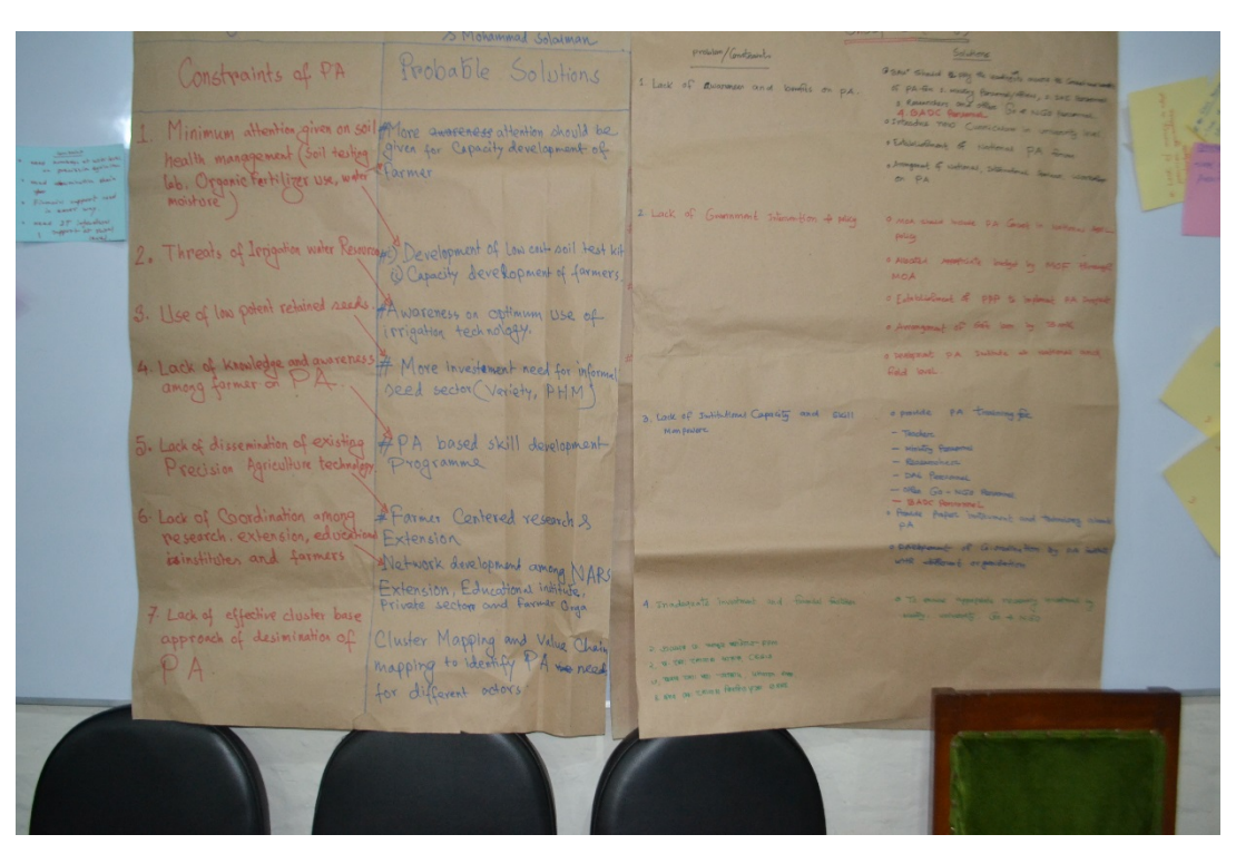
Flip chart and notes during group discussions (Bangladesh)