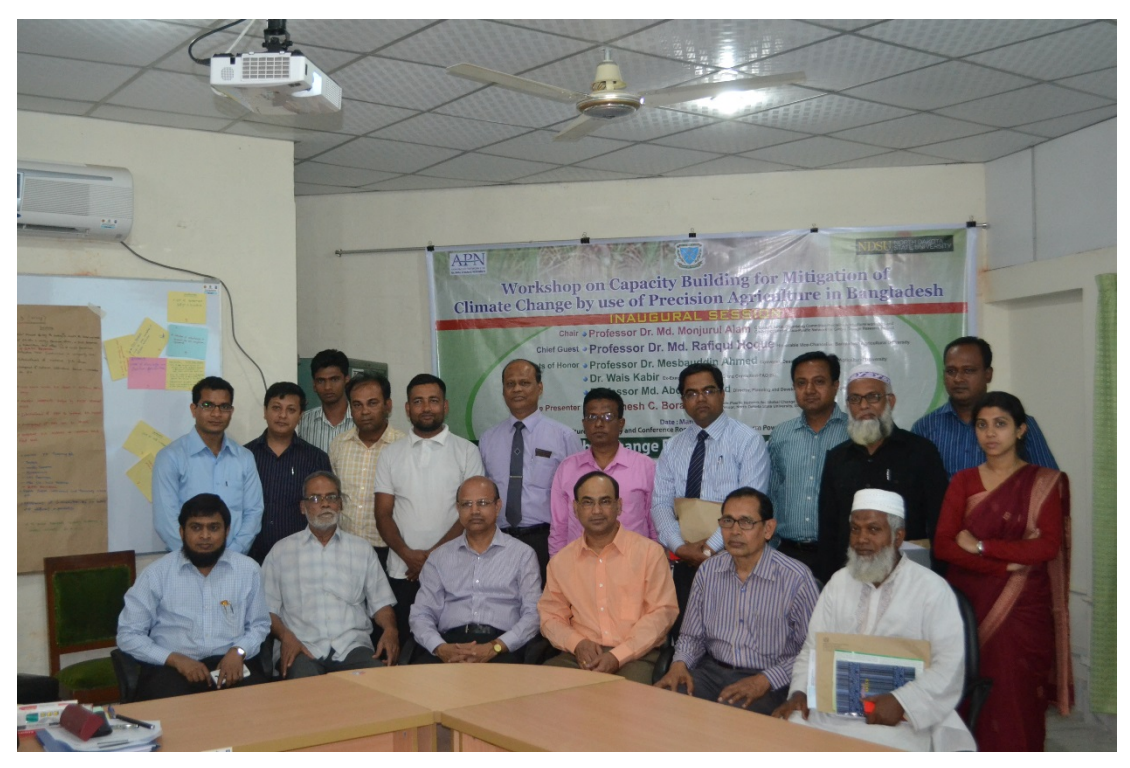
Group Photo participants (Bangladesh)