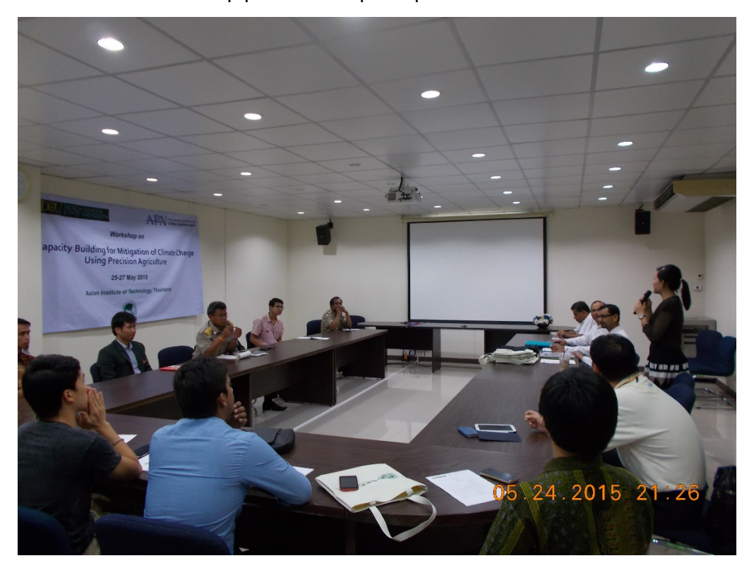
Discussion among the participants (Thailand)