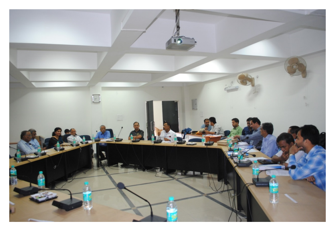
Day 2 Technical Session (India)