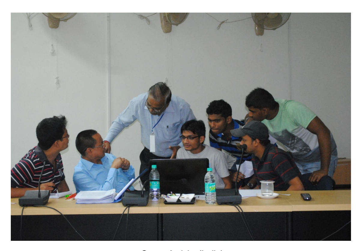
Group Activity (India)