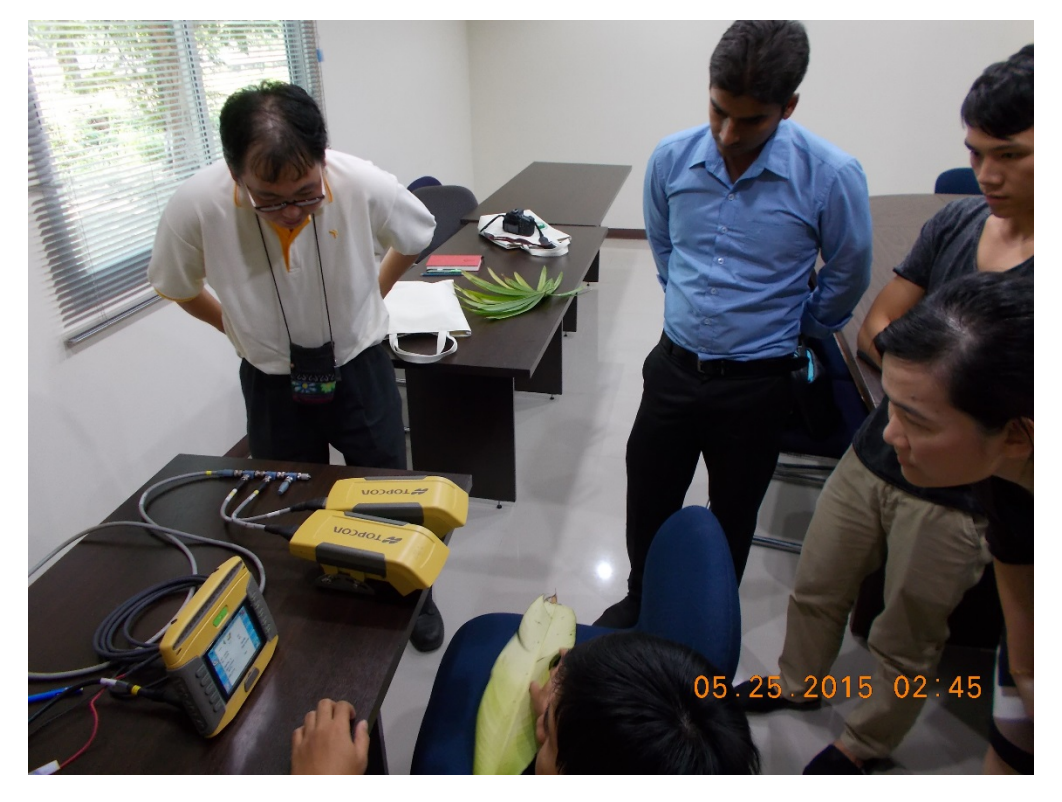
Working of crop sensors (Thailand)